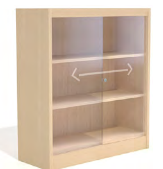
Sliding Glass Doors