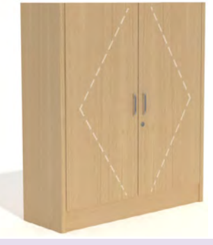
Wood Hinged Doors