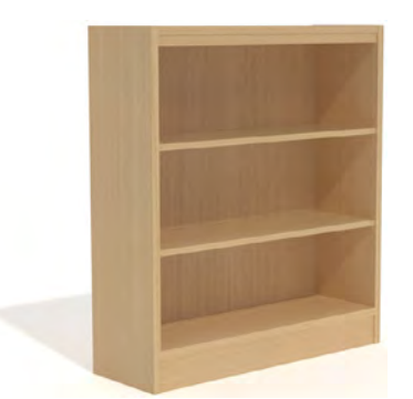
Standard Flat Shelving

*Wood Shelves can accommodate weight loads of 45 lbs./sq.ft. without deflection in excess of 3/32".