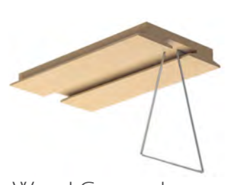
Wood Grooved Shelf